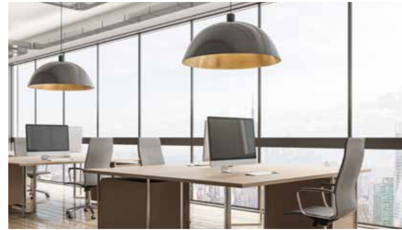
Offices, meeting rooms and professional studios