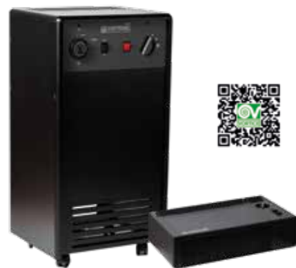
PURIFIERS + IONISERS