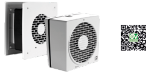
AXIAL FANS FOR WALL/GLASS INSTALLATION