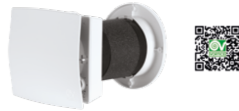
DECENTRALISED HEAT RECOVERY UNITS

VORTICE VARIO Range is composed of fan extractors able to exchange the air. They introduce clean air from the outside into the premises and extract the polluted air, ensuring our safety and health.