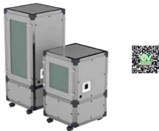
AIR PURIFIERS WITH HEPA H14 FILTERS AND PHOTOCATALYSIS MODULE

VORTRONIC Range is composed of air purifiers + ionisers suitable for environments up to 200 m 3 . They are able to eliminate up to 98% of the pathogens in the air, such as pollen and microparticles, which are potential carriers of viruses and bacteria.