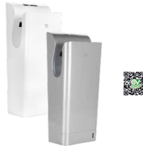
AUTOMATIC HAND DRYERS

Soap and gel dispensers are automatic electric dispensers of soap or disinfectant gel. The right amount of soap or gel - without touching anything.