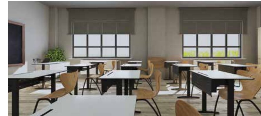
Universities, schools and kindergartens