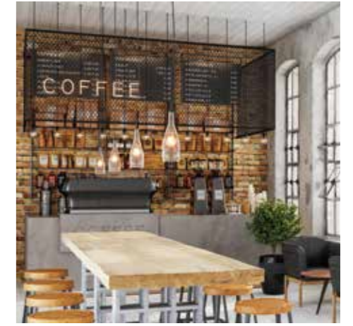
Restaurants, bars and canteens