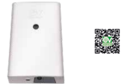
SOAP AND GEL DISPENSERS